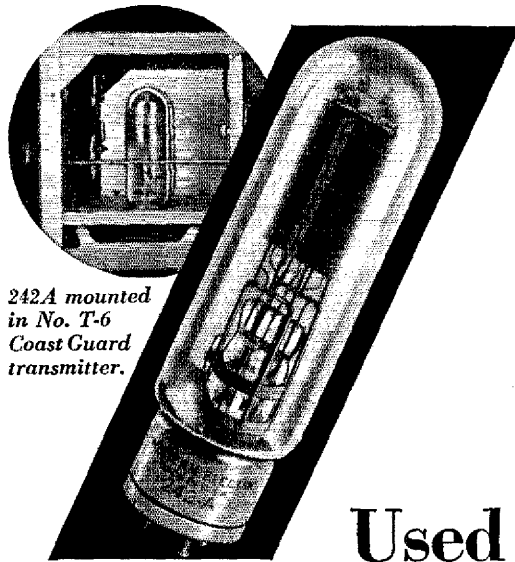
242A mounted in No. T-6 Coast Guard transmitter.